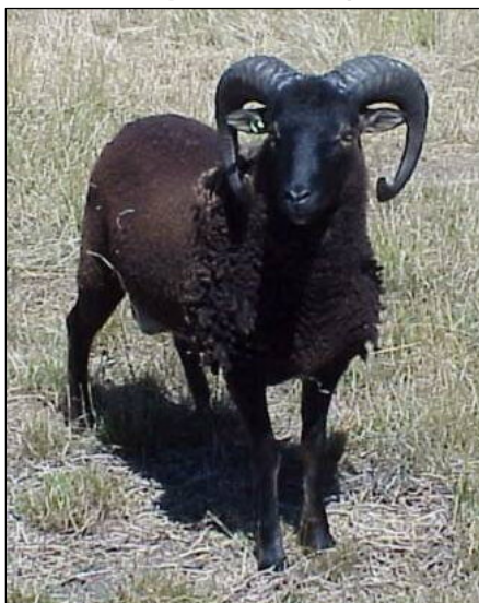
Figure 1. Blue Mountain Atlas

Atlas had little evidence of black in his ancestors. In his first lamb crop of 5 lambs (2004) there were no blacks. Yet, to the surprise of some, in 2005 he produced at least six blacks (out of 14 lambs). It was as if magically something had caused blacks to appear. How could blacks seem to suddenly arise when only one of the 4 ewes producing the blacks was black herself? Diagramming the relevant relationships, even with the help of modern pedigree software, is tedious. Figure 2 shows a mapping of the 6 blacks sired by Atlas in 2005, the ancestors of those dams as well as Atlas. In this chart, in addition to direct ancestors of the 2005 Atlas blacks, those sheep that are black and related to those ancestors, (demonstrating that the ancestor was carrying, but not showing black) are included.